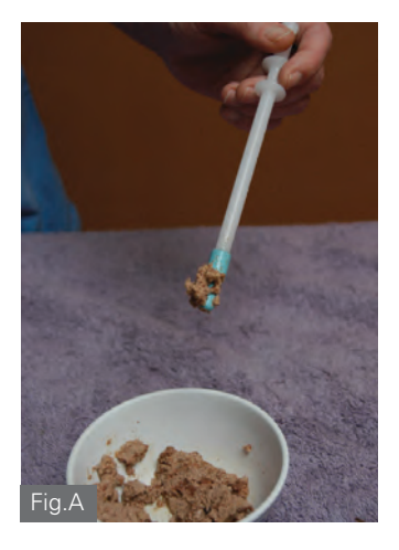
Fig.A, Step 1a: Start by putting treats (or wet food) in the pill gun and letting the cat eat from it.