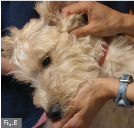
Fig.E, Step 3a: Get to the point where you can stick your finger in the ear while giving treats.