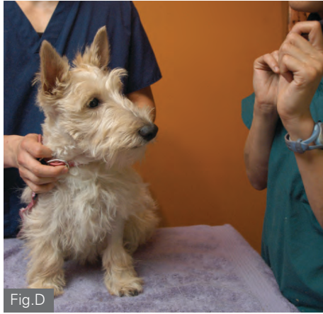
Fig.D, Step 2b: As always, remove both the treat hand and the rubbing hand before the dog is finished eating. When the dog is good at this step for several trials, move on to the next step. Systematically work your way into the ear and use more rigorous handling, but take care not to move along too quickly and elicit a bad reaction.