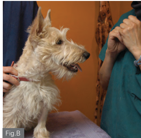
Fig.B, Step 1b: As the dog finishes the treats, remove both the treat hand and the hand that's rubbing the dog.