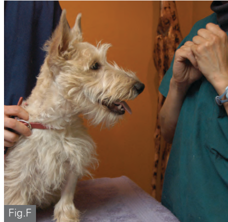
Fig.F, Step 3b: As the dog finishes the treat, stop handling. The dog should be focused on you with the expectation that she will get more treats.

The dog should now be accepting rigorous ear handling while receiving treats. Next, you can handle the ears for 10 or more seconds before pairing handling with treats or you can go directly to operant counterconditioning, where you'll use the treat as a reward for good behavior.