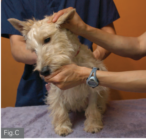
Fig.C, Step 2a: When you can rub the ear area in this manner several times in a row while the dog eats, begin to rub an area closer to the ear base, or rub the pinna instead. You might need to start with light pressure. Make sure the dog has begun eating the treat before you start rubbing the ear.