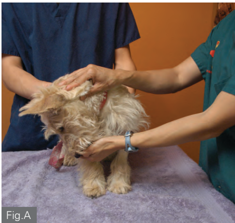
Fig.A, Step 1a: Rub the skin or fur near the ear vigorously while feeding treats. Feed the animal long enough so that you can rub the skin for 3-5 seconds. The dog's mouth should be physically on your hand eating treats the entire time. Make sure you start on an area that does not cause the dog to react to the handling.